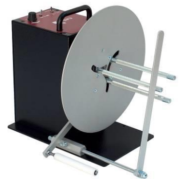
CAT-3-TA-ACH with APG

keep the unit from moving. The CAT-3 handles any rewind job and with its "HIGH" torque range can also power the LABELMATE S-100 or S-200 Label Slitters. Reliable, high quality and maintenance-free.